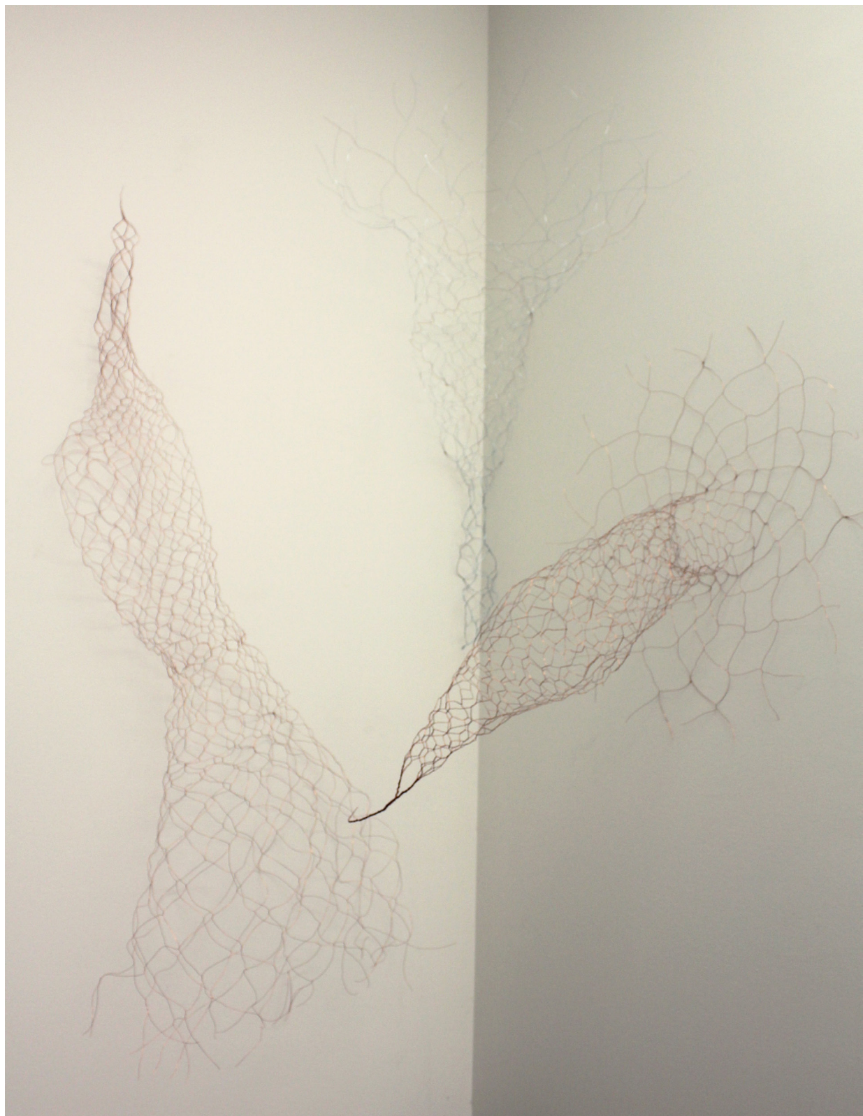
IMAGE: Sarah Zuckerman, Seelen (Souls) , 2015, Woven Wire Sculpture, Variable Dimensions (Detail Image Facing Page)