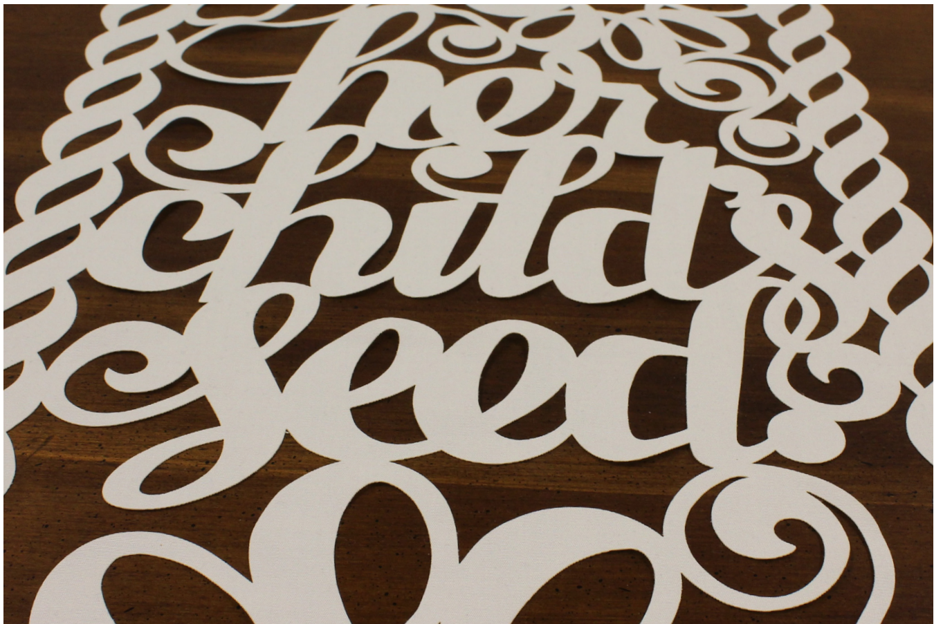
IMAGES: Ariel Rudolph Harwick, Grandmother , 2015, Laser Cut Cloth on Wood Table, 30 x 43 x 60 inches (Detail Image Bottom and Facing Page)