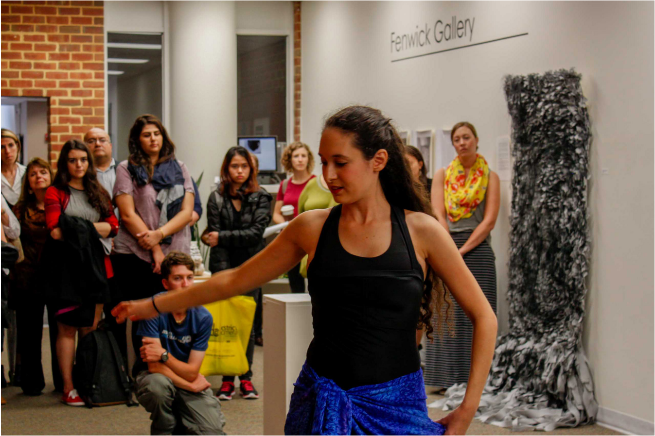
IMAGES: Anne Smith, Nameless Place Detail, 2015, Paper and Acrylic Paint, 16 x 16 x 16 inches (Facing Page)

To this day, I still can’t name the order of colors in a rainbow.