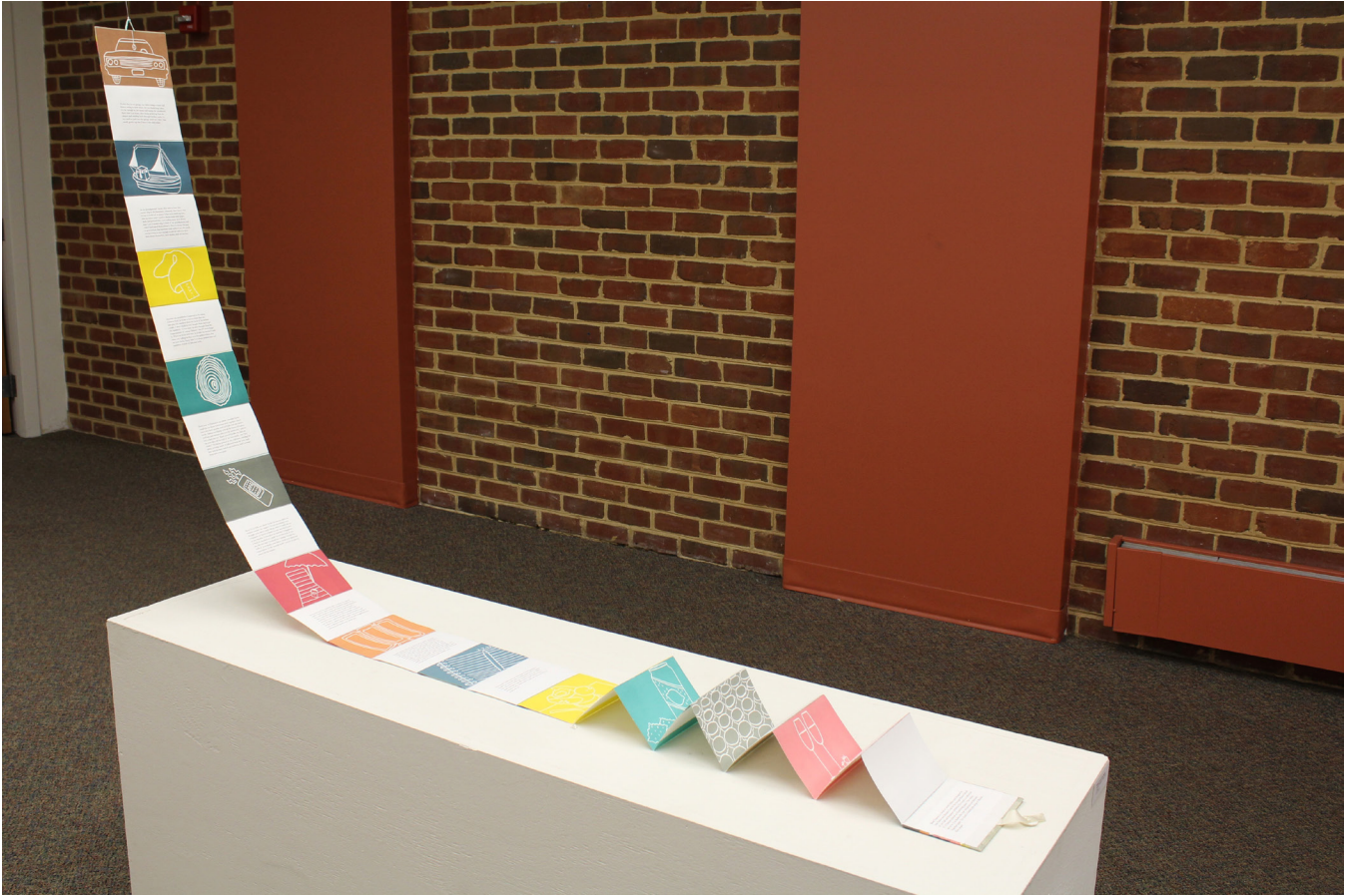
IMAGE: Melody Cook, Shared Treasures , 2015, Linocut, 33 x 6 x 39 inches (Detail Image Facing Page)

them about it. There’s always this gap in generations that fascinates and saddens me: the youth not knowing to care enough to ask the elders in their lives about themselves, their stories, until it’s too late.