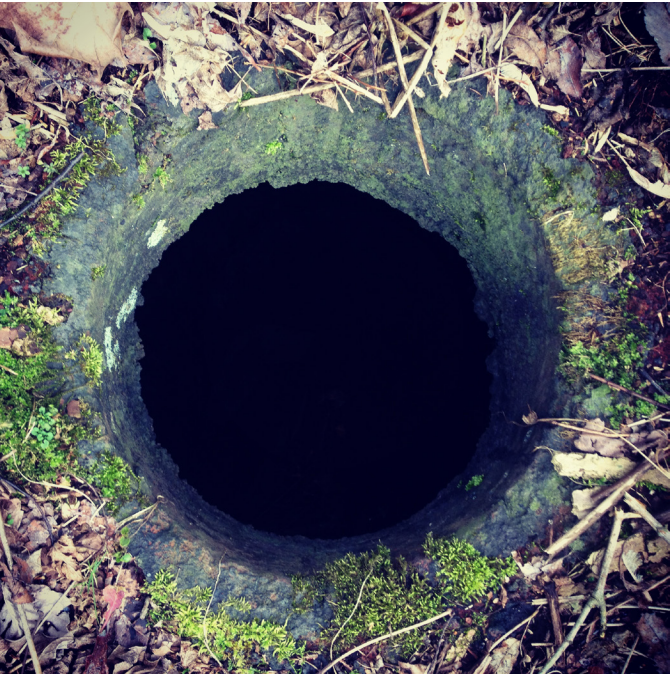
IMAGES: Nikki Brugnoli, Reckoning Space , Series of 2, 2015, Digital Photographs, 8 x 8 inches each (Detail Image Facing Page)