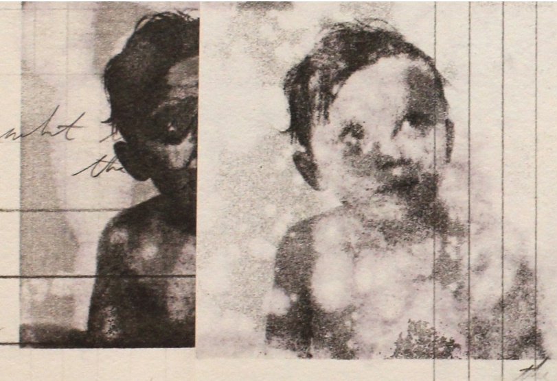
IMAGES: Josh Whipkey, Untitled Sketches , 2015, Pencil and Photo Transfer on Paper, 7 x 7 inches (Detail Image Facing Page and Bottom)