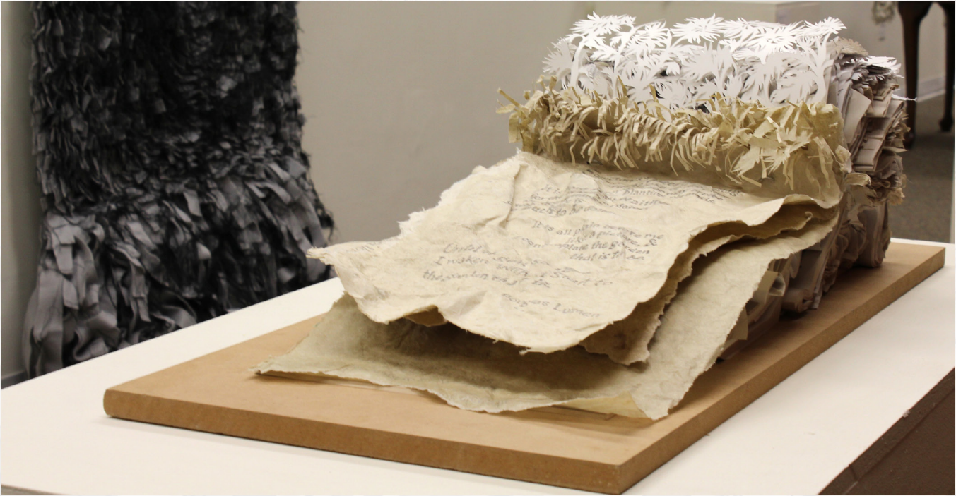
IMAGE: Alice Quatrochi, Fantasy sprouts Fallow , 2015, Sculptural Book: Appropriated Paper and Handmade Flax, 36 x 5 x 10 inches (Detail Image This Spread)

Sometimes I long impatiently to turn the wheel of the seasons forward a spoke or two, that the hour may arrive for planting clematis. It is hard to sit waiting for the season ordained for doing things when there is so much to be done. It is all plain before me, like a picture, & I contemplate the garden that is to be, until it gets so real I waken with a start to the garden that is.