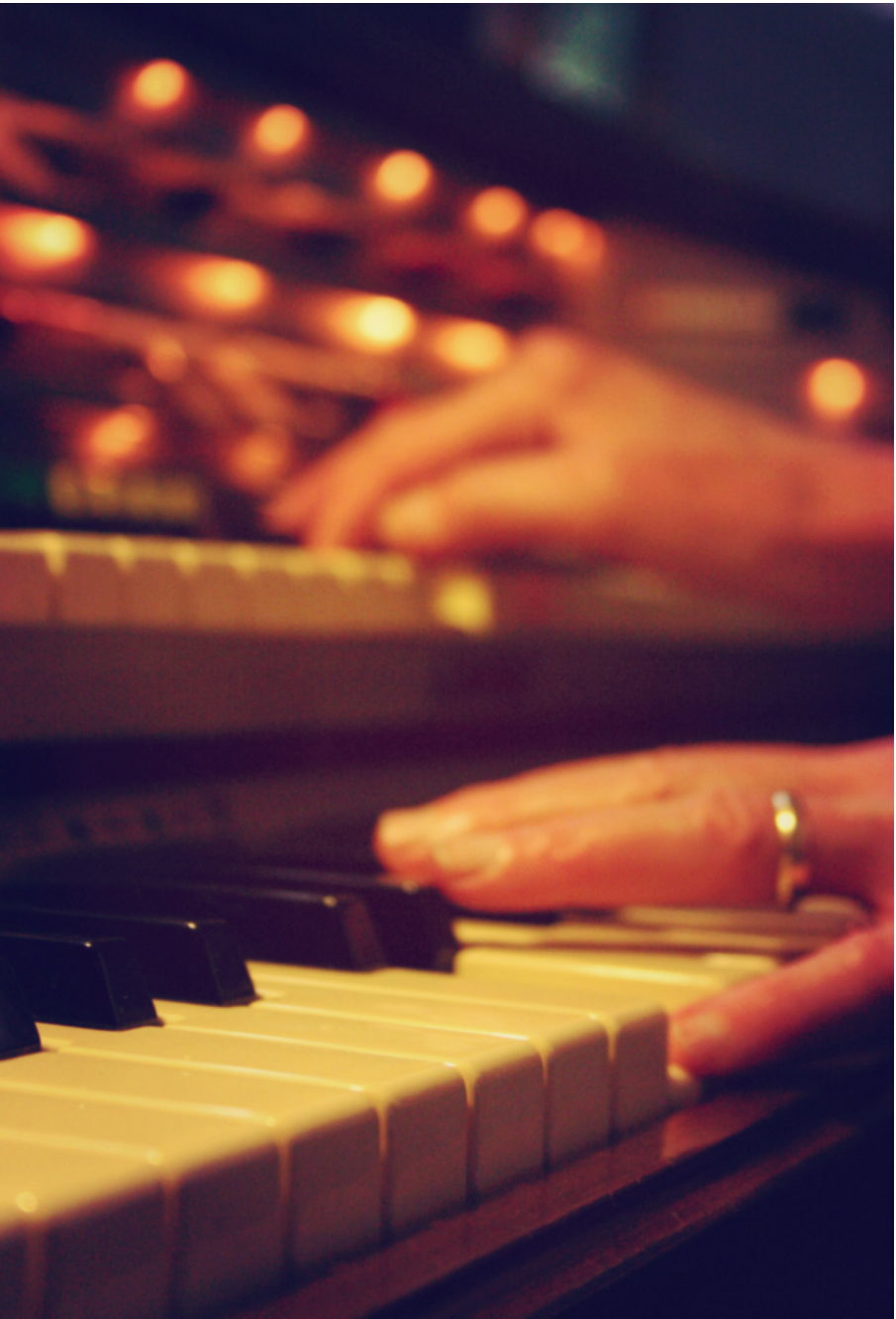
IMAGE: Madeline Graham, Cantate Domino , 2015, Matte Print, 8 x 10 inches (Detail Image Facing Page)