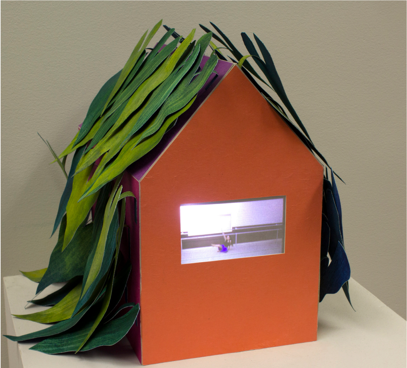
IMAGE: Anne Smith, Nameless Place Detail, 2015, Paper and Acrylic Paint, 16 x 16 x 16 inches

Before I left, I toyed with the idea of a tattoo, of blue etches chaining my body to one place. But the thought of being permanently chained to a place repulsed me. The urge to escape fills me. Repulsion propels me forward, searching for new landscapes to bury myself in.