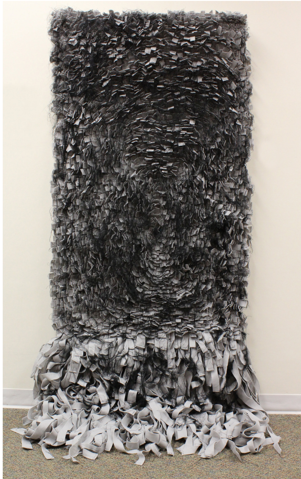
IMAGE: Melissa Hill, Kismet Tapestry , 2015, Felt, Thread, 39 x 102 inches (Detail Image Facing Page)