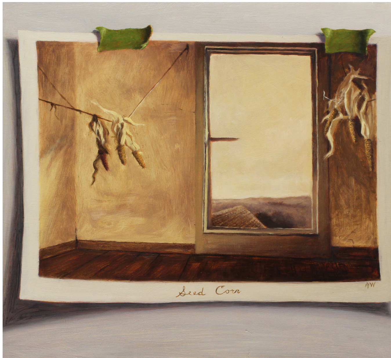
IMAGE: Nathan Loda, Traditions , 2015, Oil on Panel, 11 x 12 inches (Detail Image Facing Page)