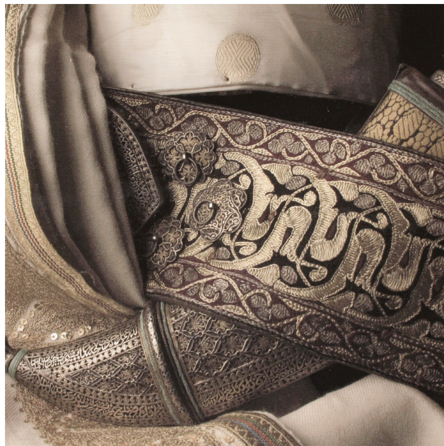
IMAGES: Noor Hamidaddin, Janbiyah , 2006, 35mm digital photograph, 12 x 12 inches each (Detail Image Bottom and Facing Page)