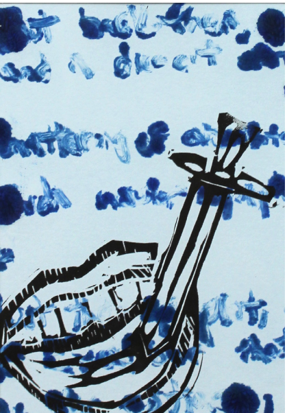
IMAGES: Meaghan Busch, Two-Eyes , Series of 4, 2015, Monotypes, 8.5 x 5 inches each (Detail Image Facing Page)